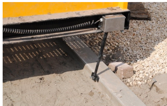
Road tracking system

The Tiger-stone is electrically powered and because of this it doesn't produce noises. Due the solid construction the Tiger-stone is not sensitive for maintenance. The Tiger-stone is amazingly easy to control because of the road tracking system. The road tracking system follows the curbstone automatically so steering is not required. Even in curves the Tiger-stone will steer automatically.